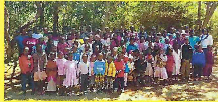
Antuanduru "Favour" Empowerment Group, Kenya (July 2023 through June 2026) Shared partnership with Faith UMC - Ft. Myers